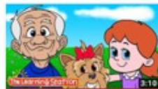
This Old Man